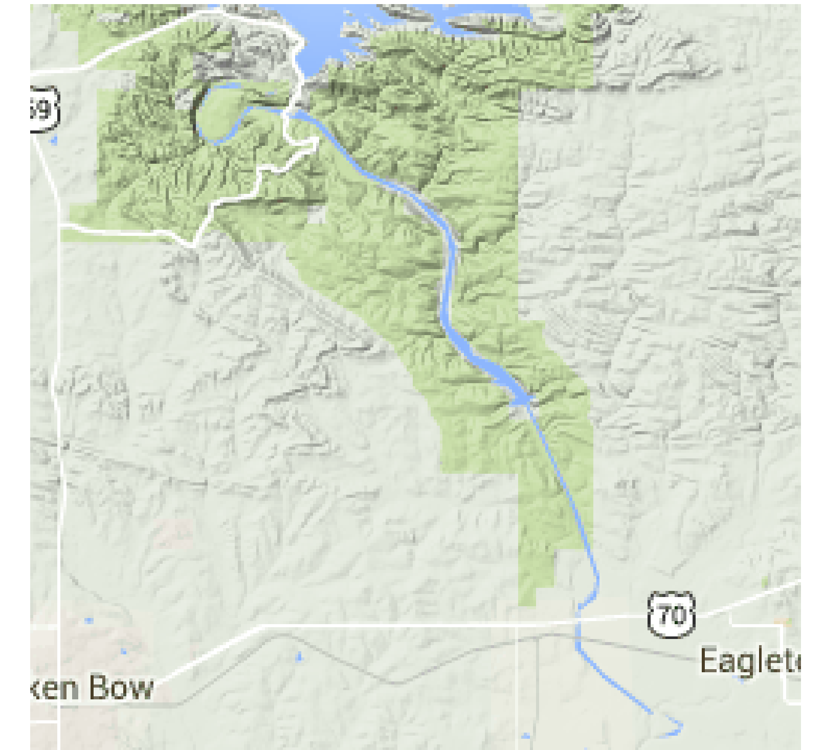
The Lower Mountain Fork River